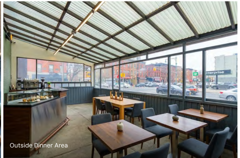
Outside Dinner Area